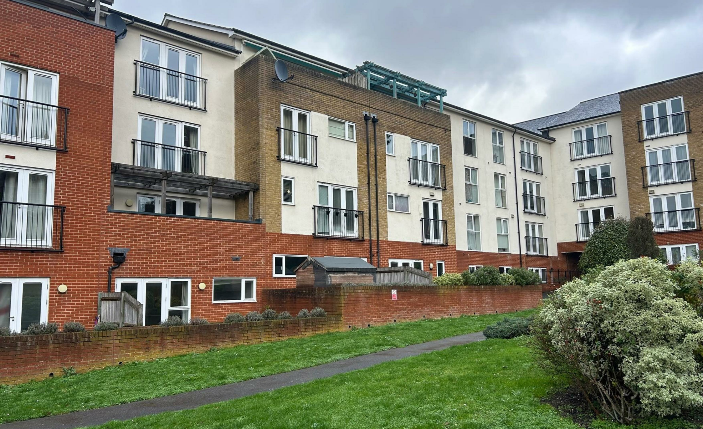
Lee Heights Bambridge Court, Maidstone, ME14 2LG £1,250